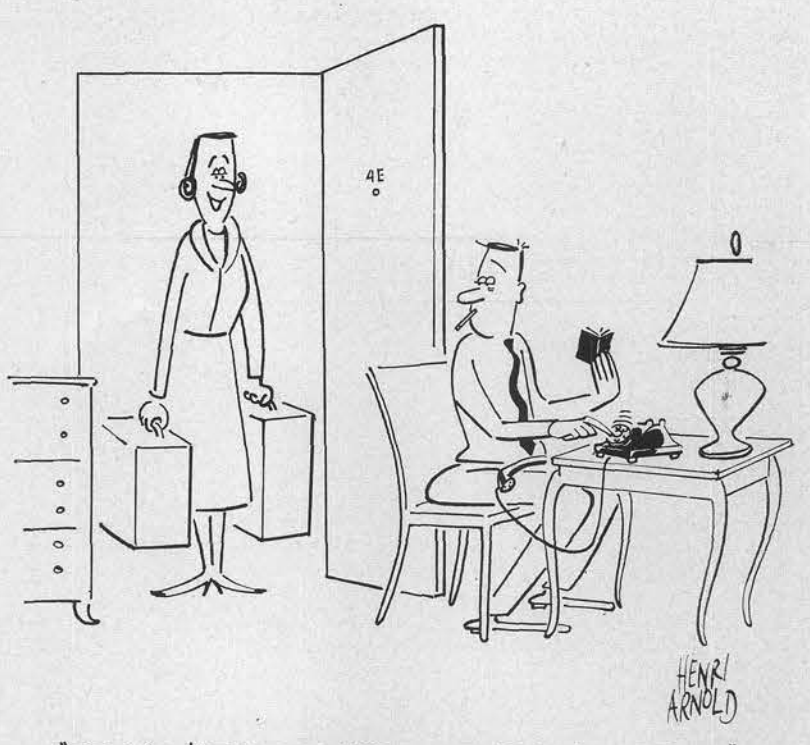
"DARLING, I'VE DECIDED NOT TO LEAVE YOU AFTER ALL"

Time of the dinner is 6:30 at Coronado Club. A special program for the Cubs is being arranged.